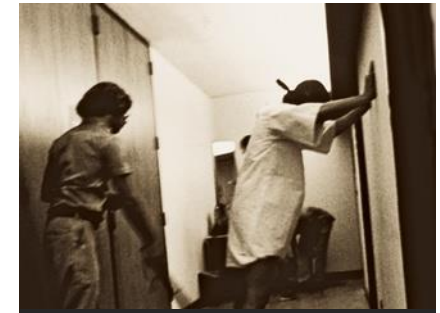
Zimbardo 1971 Prisoners Guards