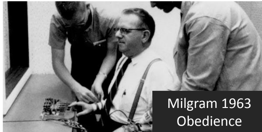
Milgram 1963 Obedience