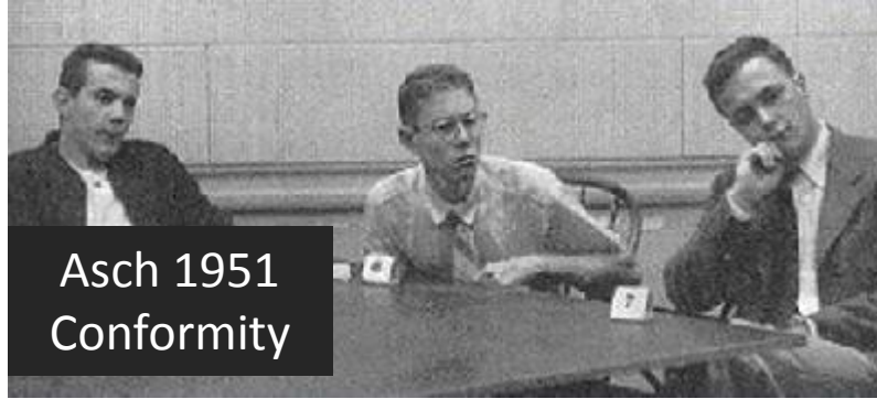
Asch 1951 Conformity